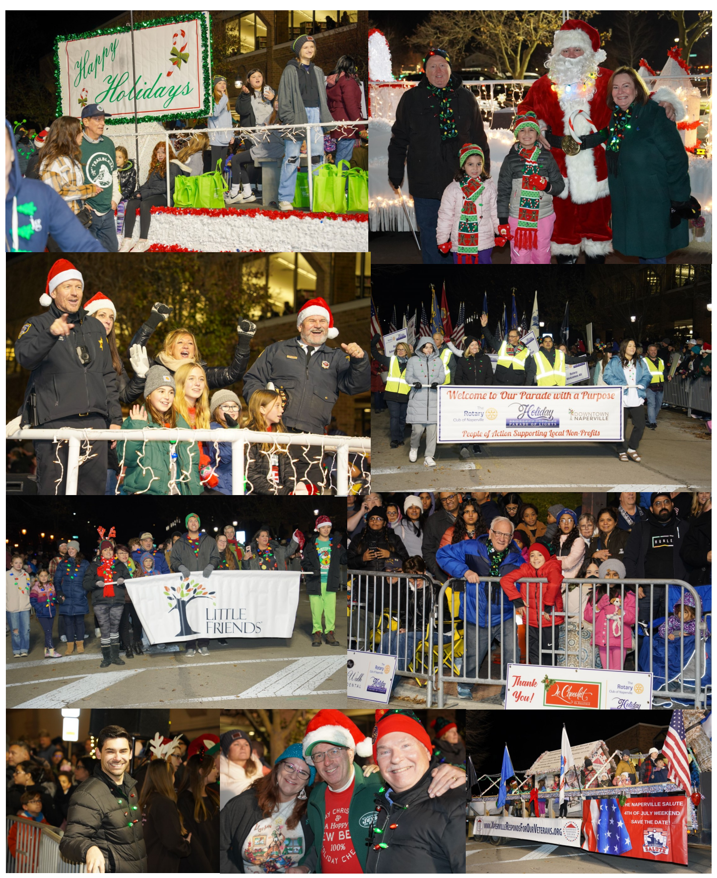
The Wheelhouse — December 2022