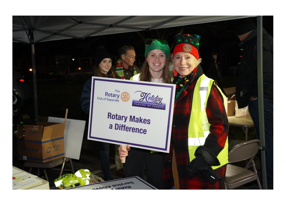
We hope you enjoyed this edition of The Wheelhouse. Look out in your inbox on January 9 for our next edition!